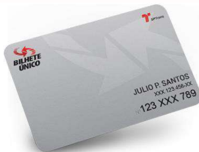
Bilhete Único Comum

The Bilhete Único is a practical way to pay for tickets in all the means of transport mentioned. To purchase it, you must register on the official website and then pick up the card at a service station. It can be recharged online or at various points around the city.