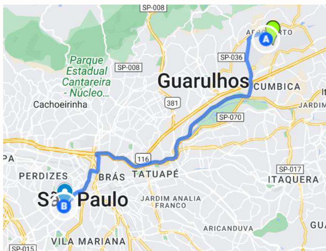
Route from Guarulhos International Airport to downtown São Paulo

Guarulhos International Airport (GRU) is the main entry point for international flights and is located about 25 km from the city center. Therefore, you will need to use public or private transport to get to your place of stay.