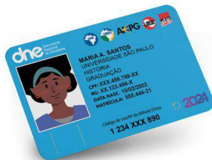
Bilhete Único de Estudante

As a graduate student, you are entitled to the Unified Student Ticket. It gives you the right to pay only half the fare for public transport. Consult your graduate office to find out how to apply for it.