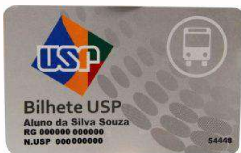
Bilhete USP (BUSP)

At Butantã Station, there is a bus terminal that offers access to the University City. You can take lines 8082-10 or 8083-10 and get off at the "ICB" stop. These lines are free for students who use the USP Ticket (BUSP), available after entering graduate school. Access the routes at the link .