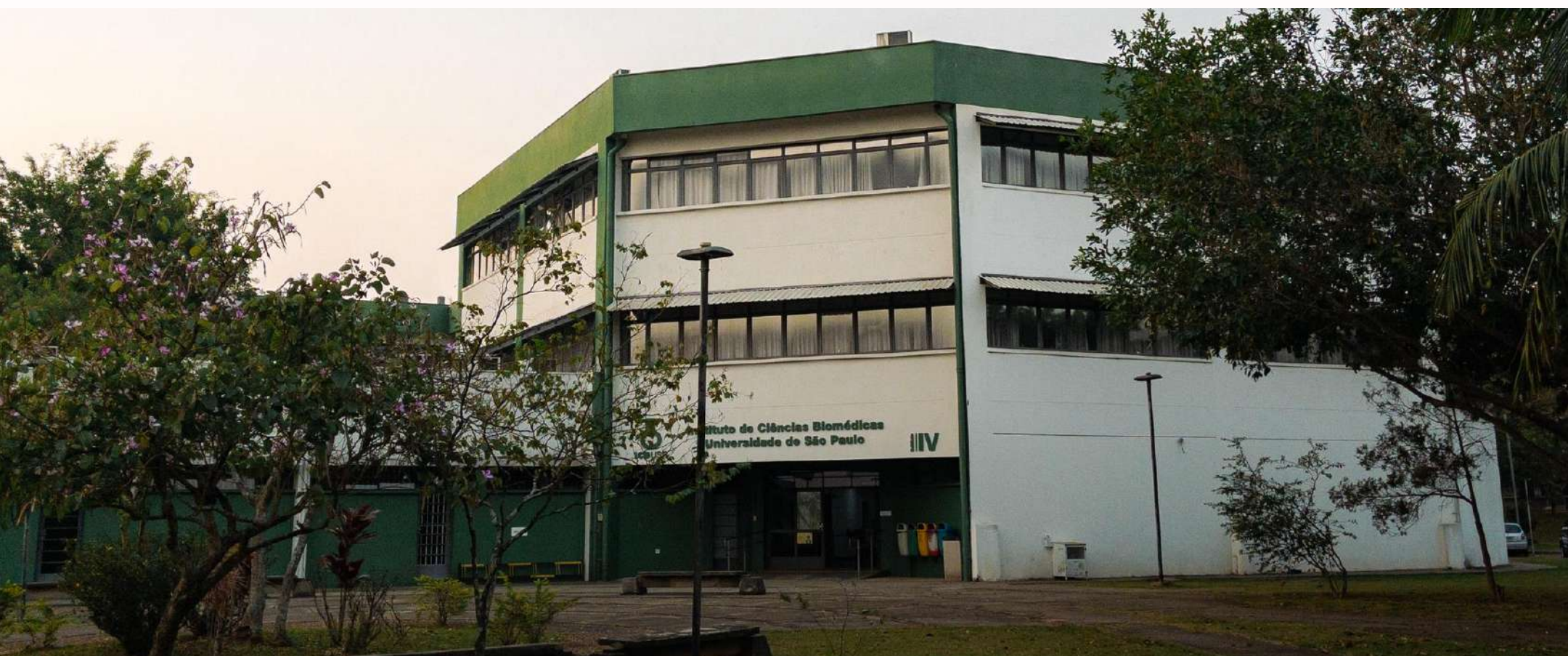
Instituto de Ciências Biomédicas (ICB)

Situated in Cidade Universitária in São Paulo, with additional facilities in Monte Negro (RO) and Acrelândia (AC), the institute comprises 7 departments and boasts a comprehensive infrastructure that includes over 150 laboratories. Presently, the ICB offers 5 Graduate Programs (PPGs) and hosts 2 Inter-unit Programs.